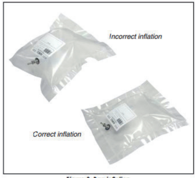
Figure 3. Bag inflation

Notice: This publication is intended for general information only and should not be used as a substitute for reviewing applicable government regulations, equipment operating instructions, or legal standards. The information contained in this document should not be construed as legal advice or opinion nor as a final authority on legal or regulatory procedures