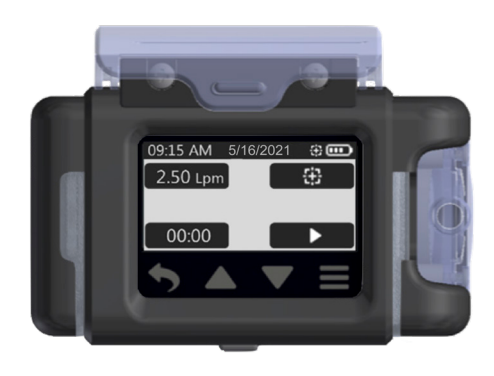
Intuitive touch operation and programming, easy Bluetooth* connectivity