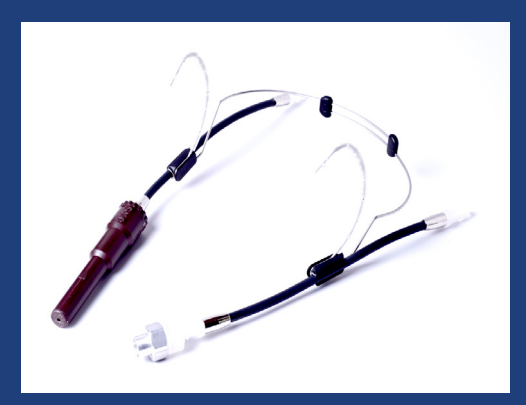
Headset shown fitted with optional mini sampler and tube holder accessories

Using the Headset with the Mini Sampler is a validated method for sampling manganese in welding fumes, and ideal for the sampling of metals in welding fumes.