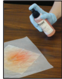
Aim at soiled wipe and depress nozzle 2 times.