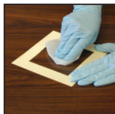
Use a template to specify sample area.

When sampling flat surfaces, use a template to maintain the size of the sample area. Disposable templates are included in the Quantitative Kit.