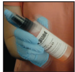
Shake well to mix.