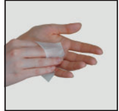
Wipe hands or skin for 30 seconds using one side of wipe.