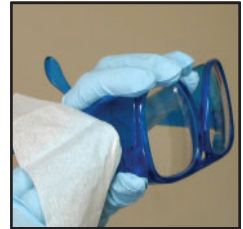
Wipe safety glasses, phones, shoes, etc. thoroughly using one side of wipe.

When taking surface samples that are to be sent to a laboratory for analysis (Lab Analysis Kit) use a template to specify the sample area.