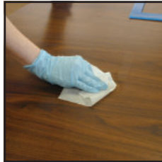
Wipe surface area horizontally, then vertically using one side of wipe.