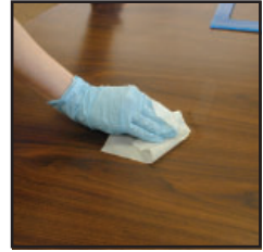
Place wipe, sample side up, on waxed paper.