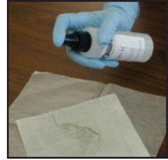
Aim at soiled wipe and depress nozzle 3 times.