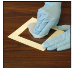
Use a template to specify sample area for samples to be sent to a lab.

Use a new pair of clean gloves for successive wipe samples.