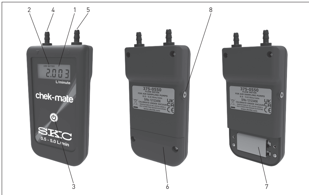
Diagram of the chek-mate Flow Meter