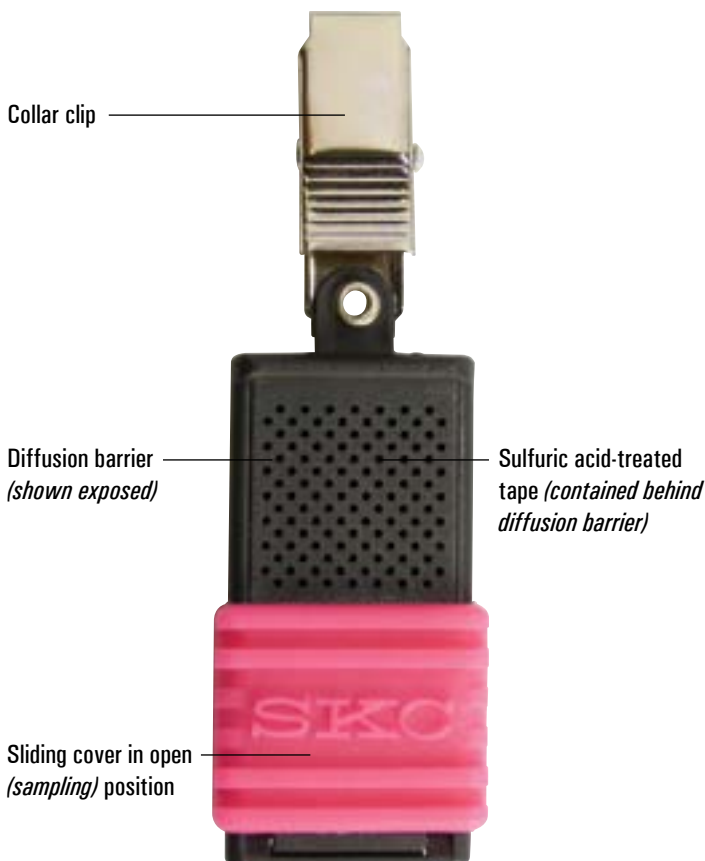
UMEX 300 Sampler with sliding cover in sampling position