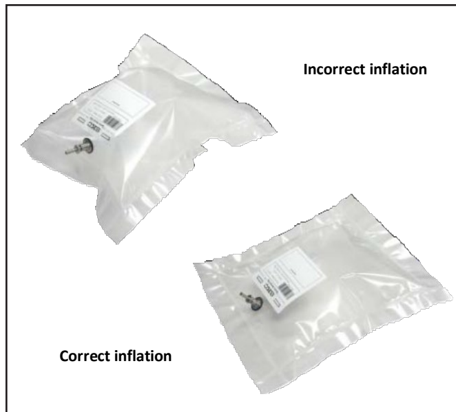
Figure 3. Bag Inflation

To begin sampling, open the valve on the bag fitting; refer to bag operating instructions. Turn on the pump and note the start time and any other sampling information. Avoid filling a bag more than 80% of its maximum volume (Figure 3).